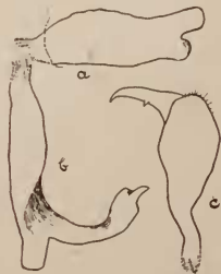
Fig. 17. Lygus communis , male genital claspers; a, lateral aspect of sinistral forcep; b, sinistral forcep dissected, dorsal aspect; c, dextral forcep dissected ventral aspect.

Male —Length 5.5 mm. Head : width across the eyes, 36*; width between eyes, 15; length (lateral measurement) 14; height at base, 22; yellowish brown or greenish marked with reddish; basal half of the tylus, arched portions of the juga, loræ, and bucculæ marked with reddish, also the front frequently marked with red in the form of transverse lines; apical half of the tylus dark brownish to fuscous; vertex full, without an impressed longitudinal line as in invitus , but having a slight triangular, flattened space just before the carina; eyes dark brownish, sometimes faded to pale on the